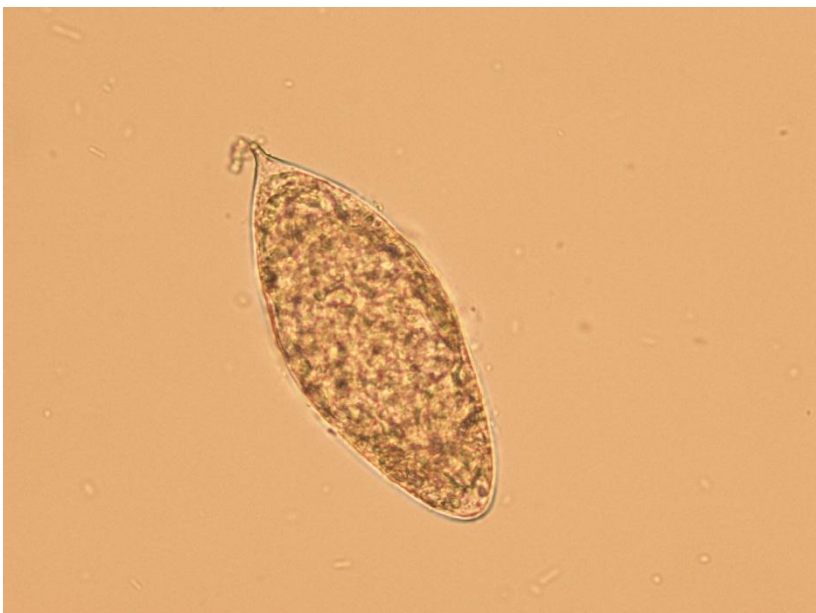
An ovum of Schistosoma haematobium

Serological tests can be of value when eggs cannot be found in clinical samples. An enzyme linked immuno-sorbent assay using soluble egg antigen to detect antischistosome antibody is currently used at the Hospital for Tropical Diseases.