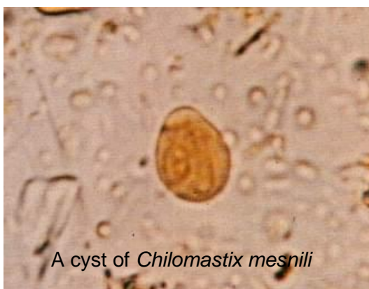
A cyst of Chilomastix mesnili

The characteristic lemon shaped cysts can be seen in a formol-ether concentrate. Motile organisms can be seen in a wet preparation of a fresh stool however the characteristic morphology is evident in a permanently stained preparation.